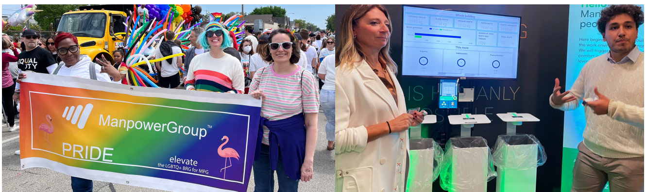
LEFT: Elevate Business Resource Group Pride March, June 2022, Milwaukee | RIGHT: Showcasing AI-Led Innovation at Viva Tech, June 2022, Paris

As we continue to differentiate our higher-value services, we are increasingly focused on innovating to “create talent at scale” by providing advice on career path choices, enhancing skill sets through training and building capabilities from scratch in technology related fields.