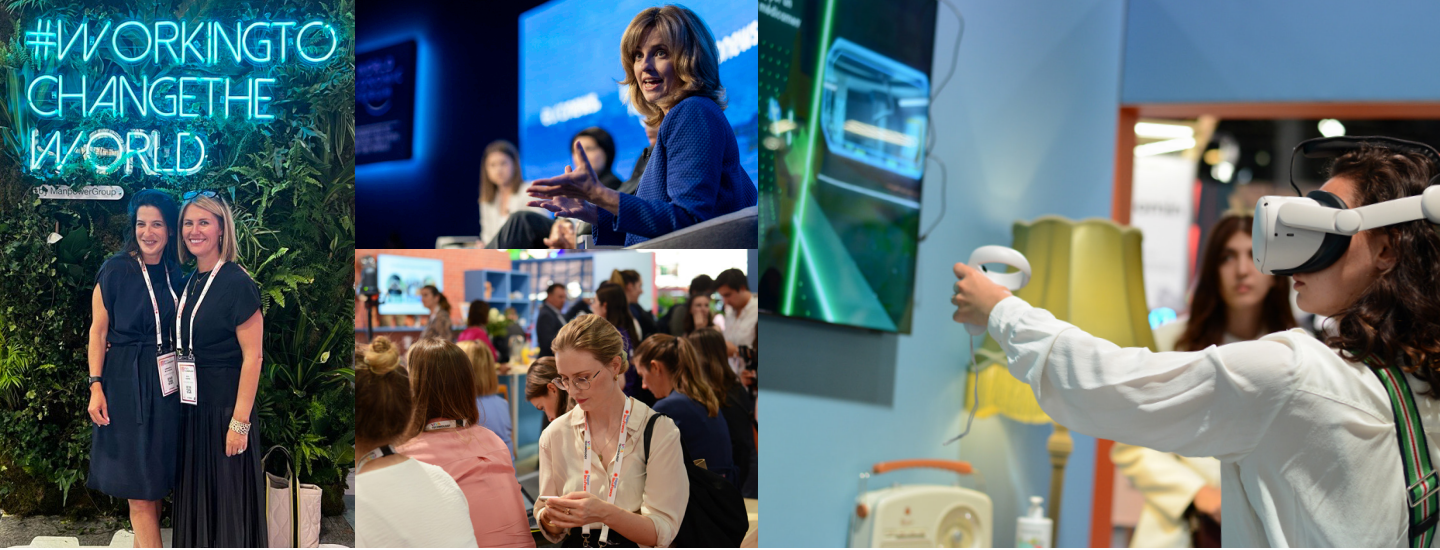
ManpowerGroup's #WorkingToChangeTheWorld lab at Viva Tech, June 2022, Paris